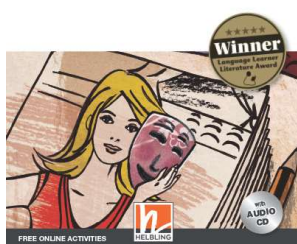
FREE ONLINE ACTIVITIES