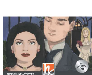
FREE ONLINE ACTIVITIES